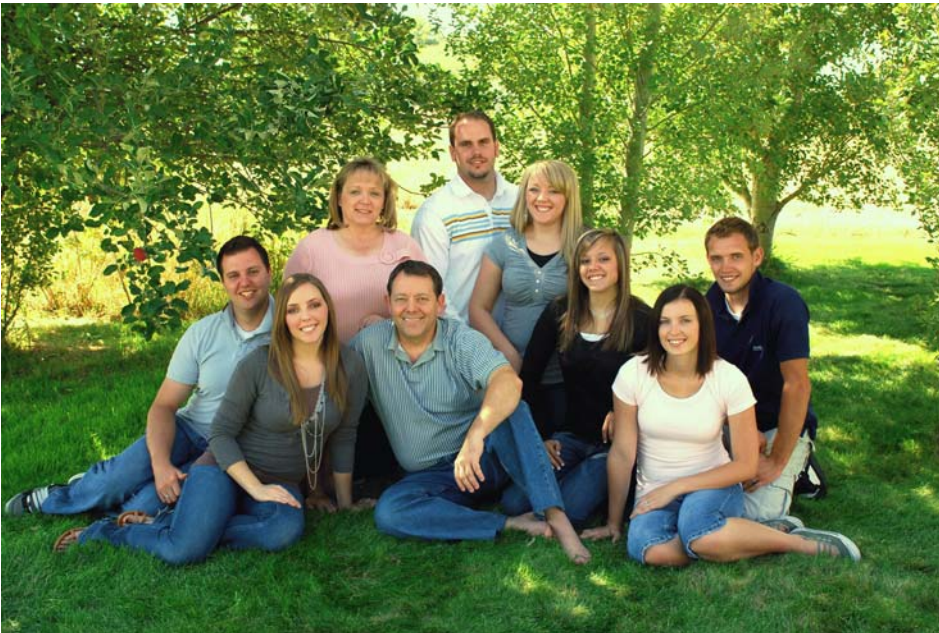
Family Picture September 2007