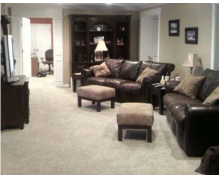
New Great Room

In July 2006, we embarked on a six-month "adventure" to remodel nearly every room in our house and add 800 sq. ft. We now have a